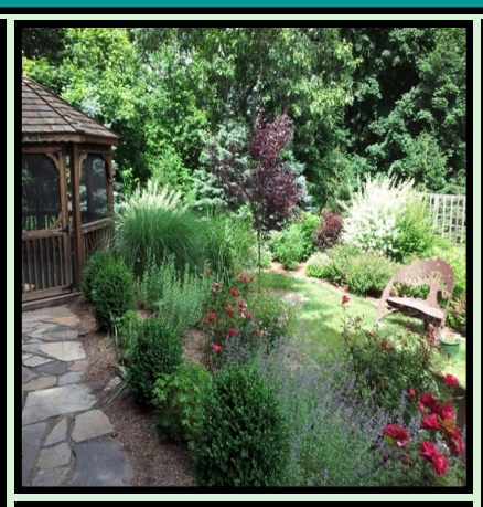
Linda's Healing Garden

Other symptoms may include: fatigue, indigestion, back pain, constipation, pain with intercourse, menstrual irregularities.